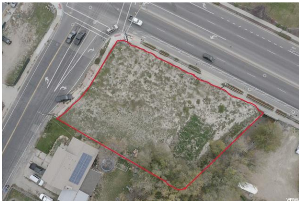
Top view/Side view

Introduction: Empty lots are found in cities and suburban areas. The landowner may be saving it for a future building project or holding it for a variety of other reasons. The \frac{1}{3} acre lot (about the size of a large residential lot) pictured below is in West Jordan, UT and is an example of what empty lots look like. Imagine that your school got permission to manage and “mitigate” (repair the damage or neglect) at the lot. In this activity you will evaluate design solutions that each 5th grade class developed and decide which solution meets the criteria and constraints. Appropriate amounts and types of work can be done on the lot by 5th graders.