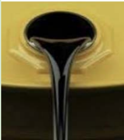
Waxy Crude Oil Before Hardening