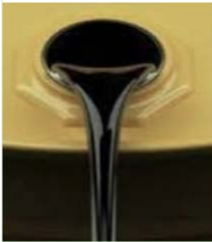
Waxy Crude Oil Before Hardening