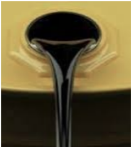
Waxy Crude Oil Before Hardening